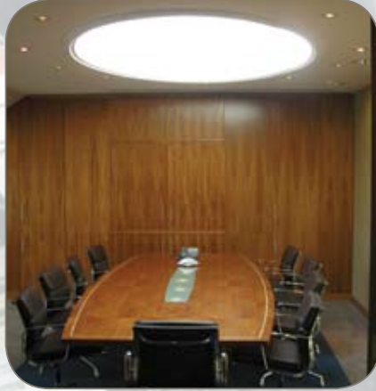
Dunedin Properties, Edinburgh

Our property framework agreements with The Royal Bank of Scotland and The Clydesdale Bank have continued to provide a series of diverse projects, including both branch and office works, reinforcing our strong finance sector track record.